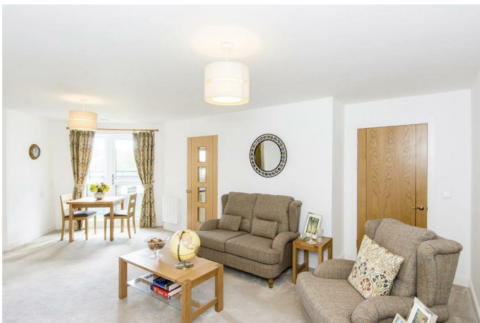
Lounge/Diner 19'9" x 14'6" (6.02m x 4.42m)

Double-glazed French doors opening out to Juliet balcony to rear. Two radiators. Spacious walk-in storage cupboard. Glazed door to kitchen.