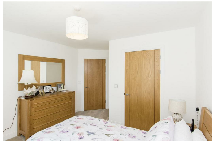
(Bedroom Photo Two)

Double-glazed window to rear elevation. Radiator. Television point. Telephone point. Large walk-in wardrobe.