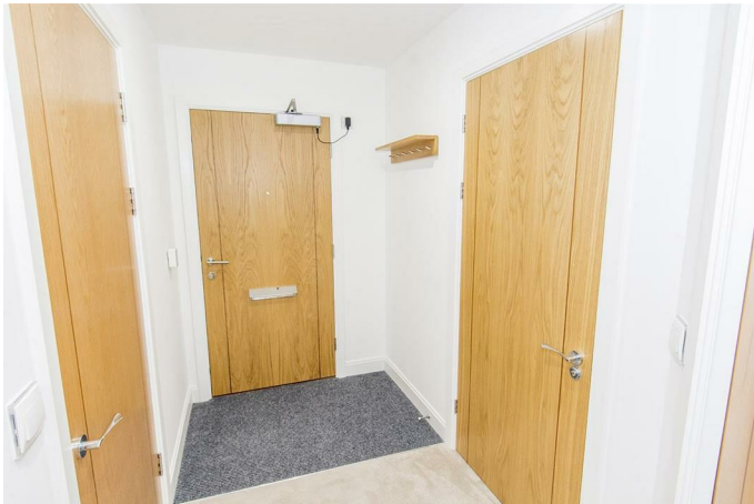
Entrance Hall 13'9" x 4'10" (4.19m x 1.47m)

Accessed via composite front door. Electric radiator. Spacious walk-in linen cupboard housing lagged hot water tank.